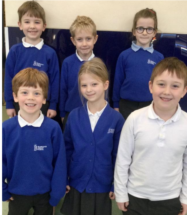
2 - The House Captains

Congratulations to the newly appointed House Captains and School Councillors for this term. We are very happy with the decision to rotate these important roles to maximise the number of children involved. Children's voice is fundamental and this move has allowed more children a chance to have their voices heard.