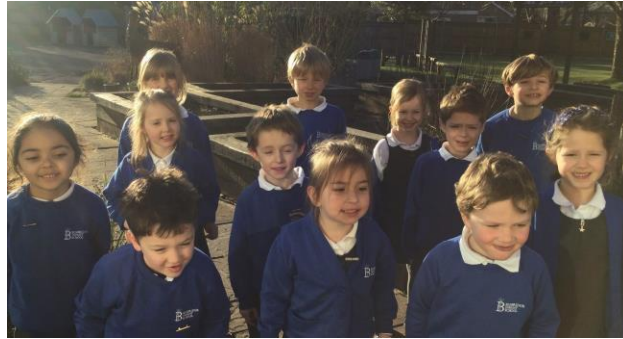
3 - The New School Council

The School Council for the Spring Term are: