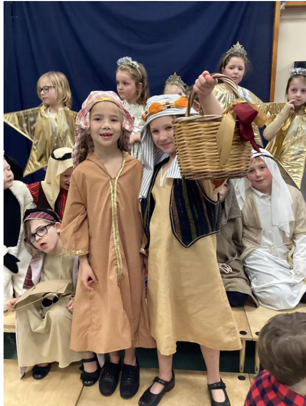
5 - Marvellous market sellers and...