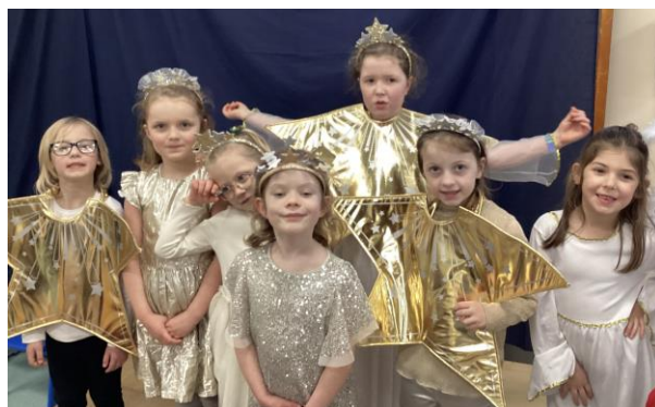
4 - Some of the amazing stars!