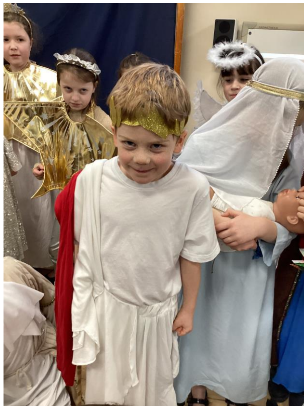
6 - ... The one and only King Herod!