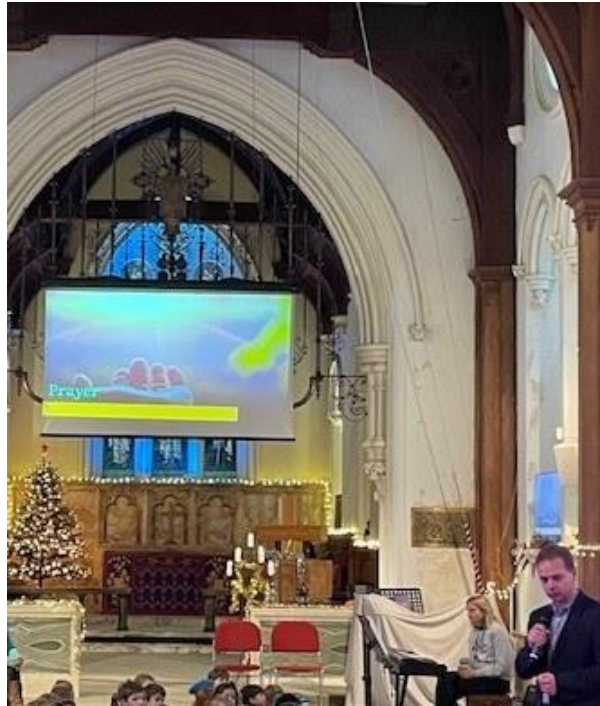
7 - Busbridge Infant School Church Service - thank to those who all took part.

Finally can I wish you all a very Merry Christmas. I hope you are all able to enjoy a well deserved break with friends and family to recharge before the new term. We look forward to seeing you in 2024!"