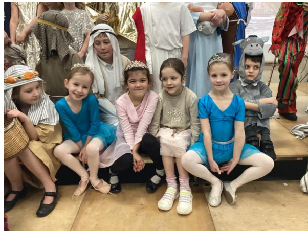
3 - The fabulous dancers!