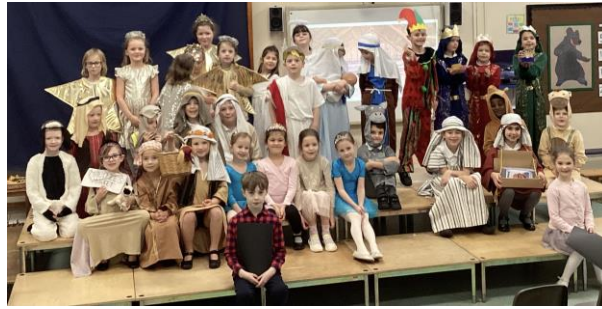
2 - Some of our wonderful Year 2 performers!