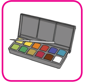
Each person needs to choose a paint colour.