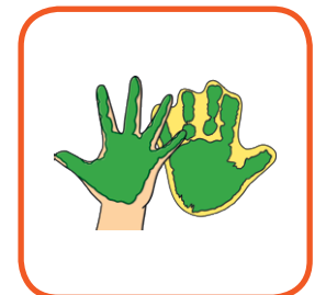
Paint your hand and press it on the piece of material, making a handprint.