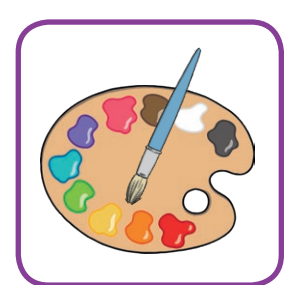
Paint and Brushes (you will need a different colour for each person).